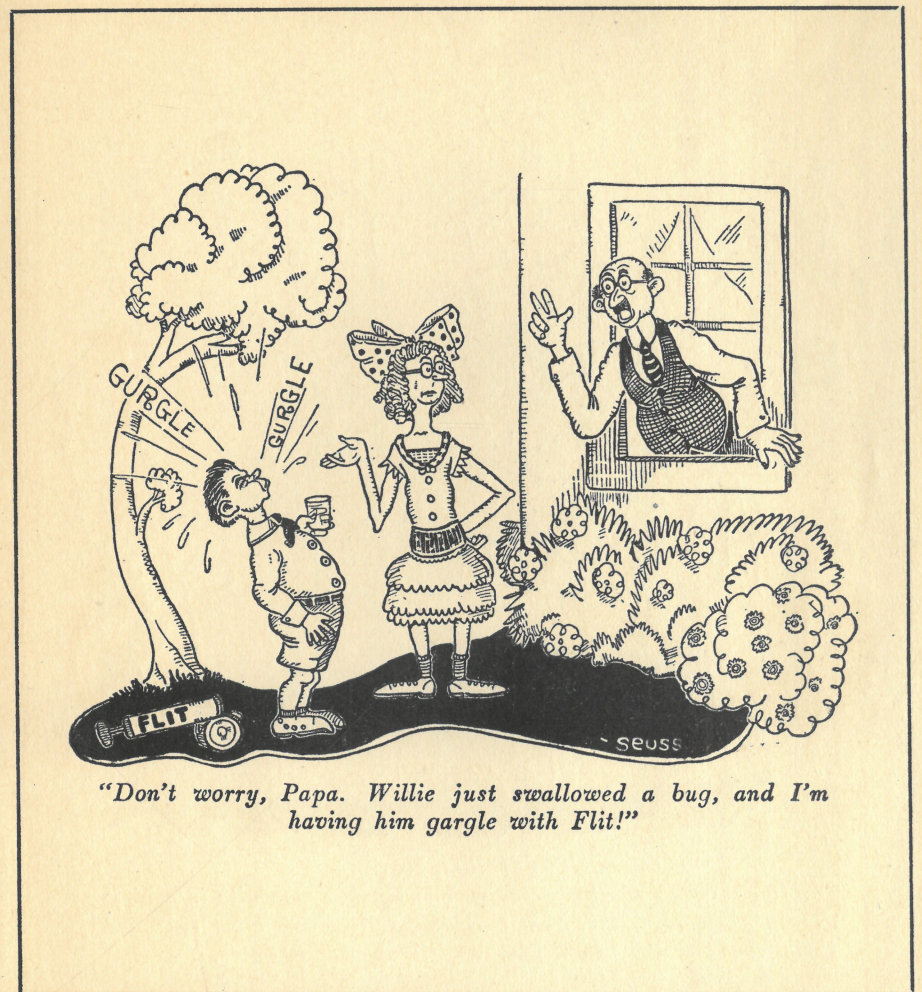
"Don't worry, Papa. Willie just swallowed a bug, and I'm having him gargle with Flit!"